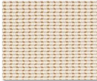
Q02 CUSTARD CREAM