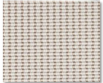
Q01 MUSHROOM SAND