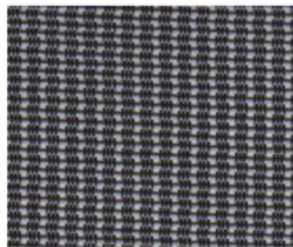
V02 NINJA GREY