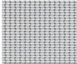
V01 PALE GREY