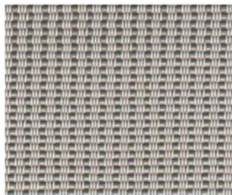
Q19 HONEY SAGE