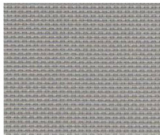
V20 PEARL/ GRAY