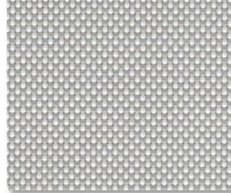
P14 OYSTER/ PEARL-GRAY