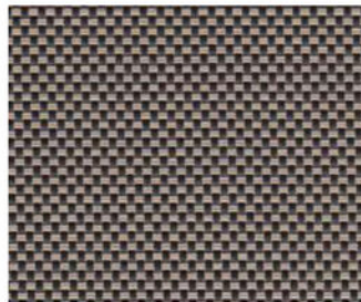
V32 CHARCOAL/ ALPACA