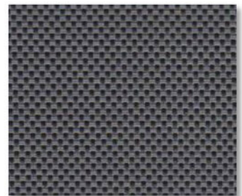
V22 CHARCOAL/ GRAY