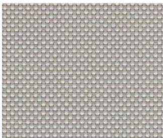
Q21 BEIGE/ PEARL-GRAY