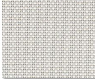
P13 OYSTER/ BEIGE