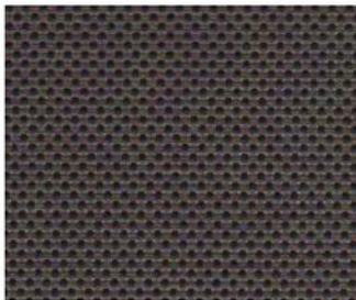
V24 CHARCOAL/ CHESTNUT