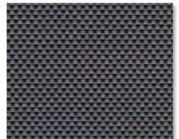
V22 CHARCOAL/ GRAY