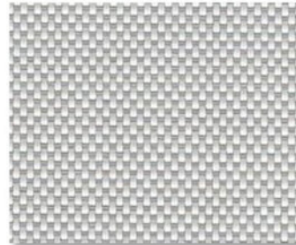
P14 OYSTER/ PEARL-GRAY