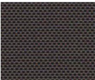
V24 CHARCOAL/ CHESTNUT