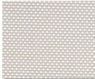
P13 OYSTER/ BEIGE