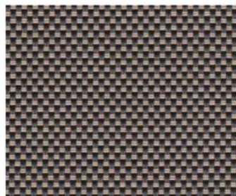
V32 CHARCOAL/ ALPACA