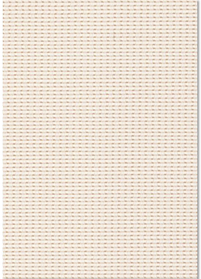
P03 ANTIQUE WHITE